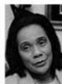
CORETTA SCOTT KING